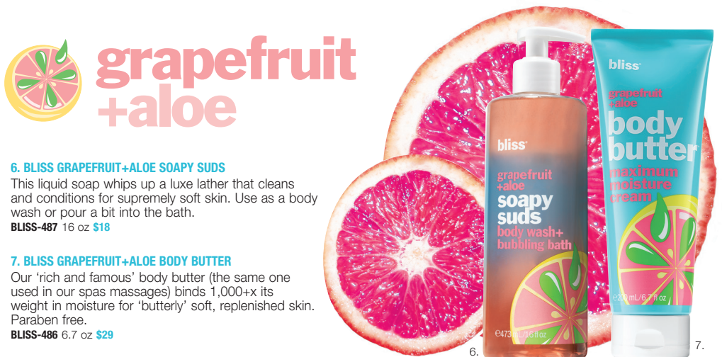
6. BLISS GRAPEFRUIT+ALOE SOAPY SUDS This liquid soap whips up a luxe lather that cleans and conditions for supremely soft skin. Use as a body wash or pour a bit into the bath. BLISS-487 16 oz $18