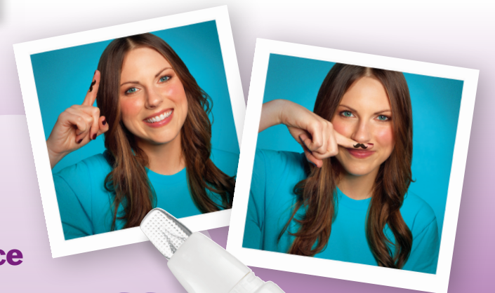
2. BLISS FUZZ OFF FACIAL HAIR REMOVAL CREAM BLISS-482 0.5oz $24