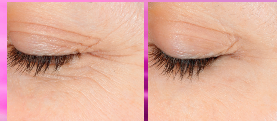
before deep crow's feet wrinkling after 8 weeks reduction in deep wrinkles

91% of panelists showed a reduction in fine lines and wrinkles in the eye area