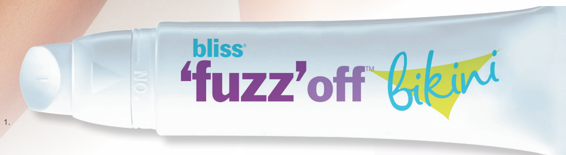
1. BLISS FUZZ OFF BIKINI HAIR REMOVAL CREAM BLISS-512 2oz $30