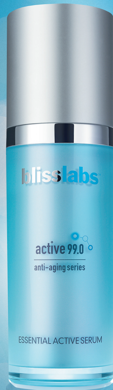
BLISSLABS ESSENTIAL ACTIVE SERUM BLISS-503 1 oz $160