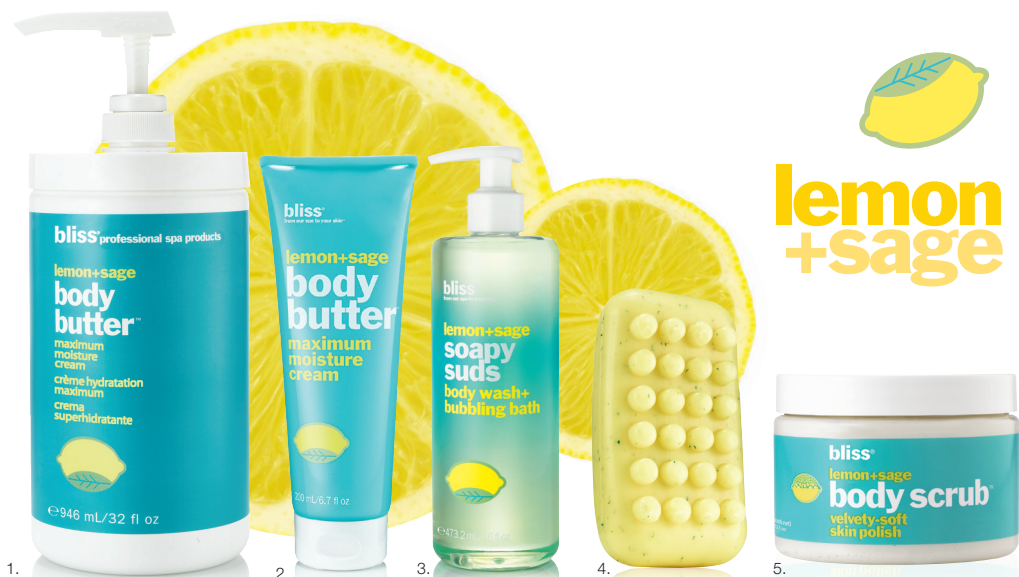
1. BLISS LEMON+SAGE BODY BUTTER PRO SIZE BLISS-338 32 oz $79 ($108 value!)

In addition to being the very same skin savers used in our spa treatments, our sumptuous butters, scrubs and cleansers have the added perk of our super-fresh, obsession-inspiring signature scents. Just remember: You do have to come out of the shower at some point!