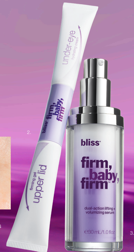
2. BLISS FIRM BABY FIRM TOTAL EYE SYSTEM The only dual-sided, dual-action solution for beautiful, younger-looking eyes. BLISS-483 .25 oz $68

** In a clinical study of healthy females from 39–60 years of age