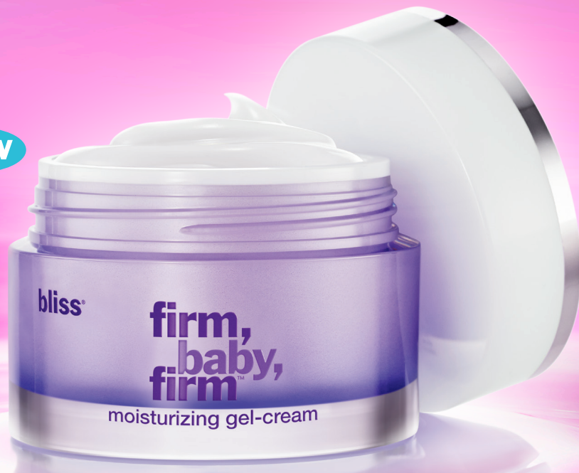
1. BLISS FIRM BABY FIRM MOISTURIZING GEL CREAM Light weight moisturizer featuring firm, baby, firm technology plus apple extract to hydrate your skin. BLISS-513 1 oz $62